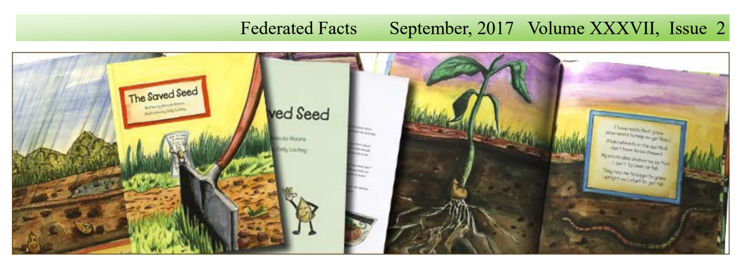
The Saved Seed A Journey Through a Seed's Life

The Saved Seed is an early reader book written to educate elementary children about the life cycle of seed plants. A North American based fall staple for thousands of years, the pumpkin is treasured in our society for being not only a food source, but a Halloween favorite! There are dozens of varie-ties ranging from tiny ornamental varieties, to those weighing in at over 100 pounds each!